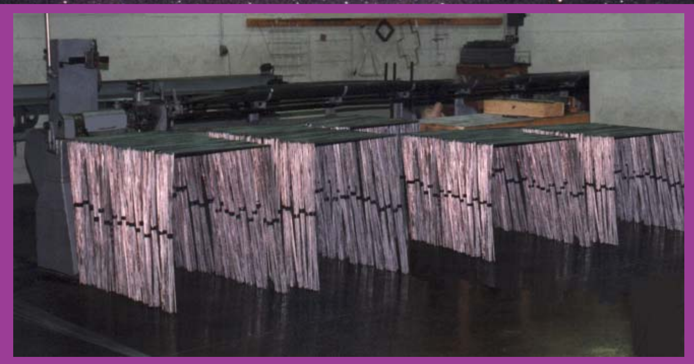
Bulk of Panel Wires

Panel Filter Support Wires are designed by BLC to effectively support all types of filter medias. Available in a variety of sizes and styles, they are used in self-sealing wires, bags and pads. Crosswires can provide additional structural integrity.