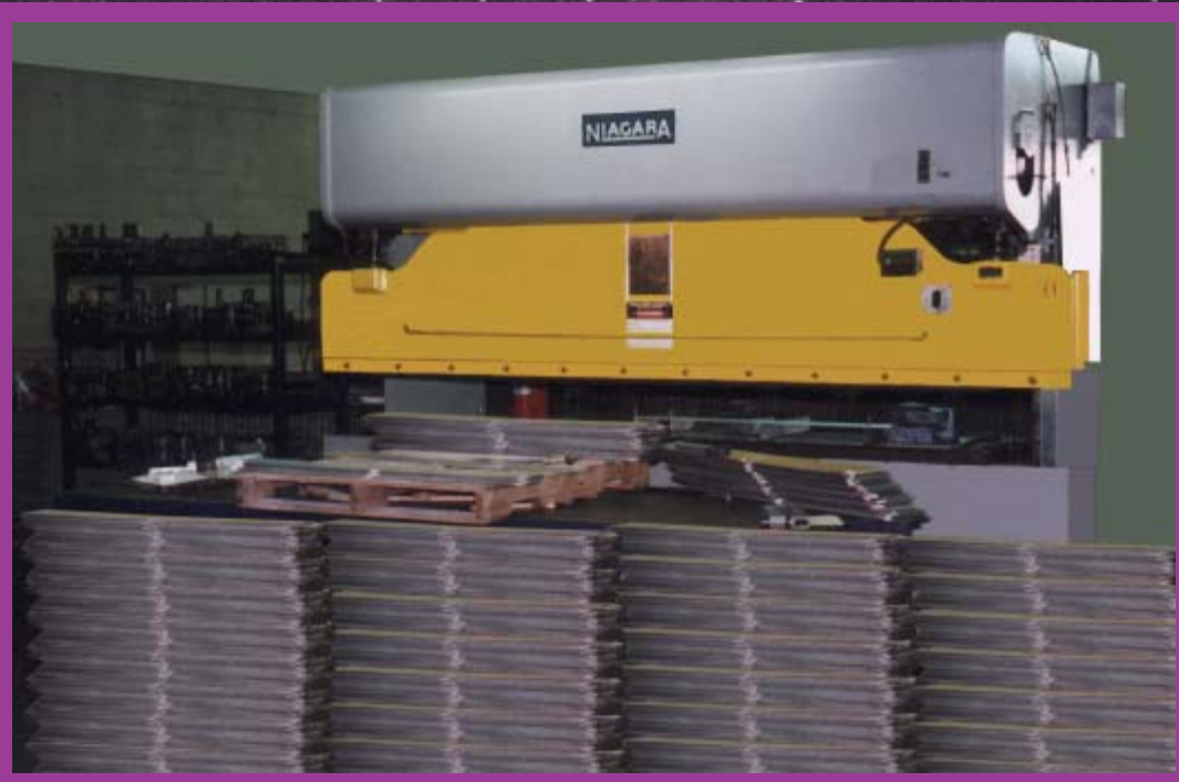
Bulk of Metal Cell Sides

Metal Filter Cell Sides are an integral component used in assembling Cartridge, Rigid Cell, HEPA or any other type of box filters. Available with headers in a variety of sizes, depths and materials for any application. Check out our Stainless and Aluminum pricing!